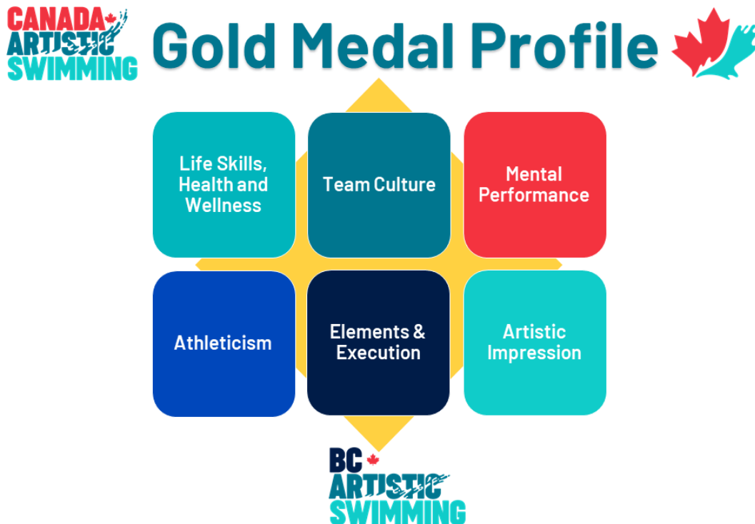
Figure 2 – Canada Artistic Swimming Gold Medal Profile

The athlete and coach nomination cycle for Canadian Sport Institute / PacificSport / BC Artistic Swimming targeting runs October 1 – September 30 annually, and athletes are selected based on performances from the previous 12 months. Athletes meeting criteria throughout the annual nomination cycle may be added to the BC Artistic Swimming targeted athlete list, on a case-by-case basis, by contacting the PSO/DSO Director of Sport at dos@bcartisticswimming.ca .